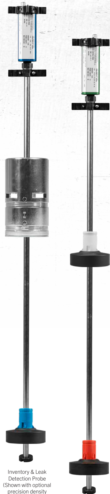
Inventory & Leak Detection Probe (Shown with optional precision density diesel float kit)